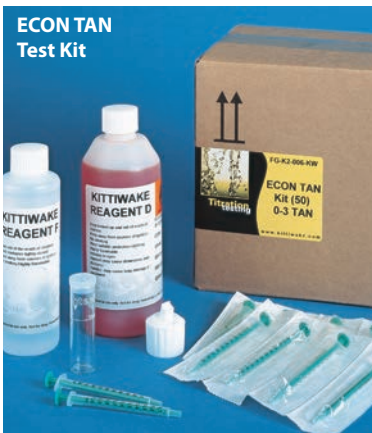
ECON TAN Test Kit

Testing for TAN is essential to maintain and protect your equipment, preventing damage in advance.