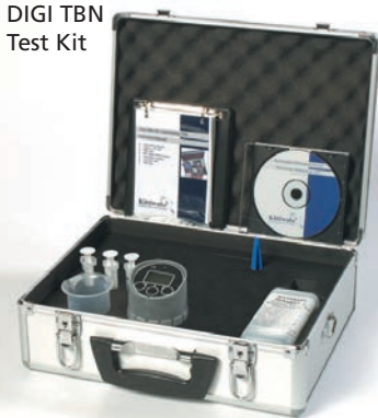
DIGI TBN Test Kit

Measure your oil's alkaline reserve and ability to neutralise acids from combustion.