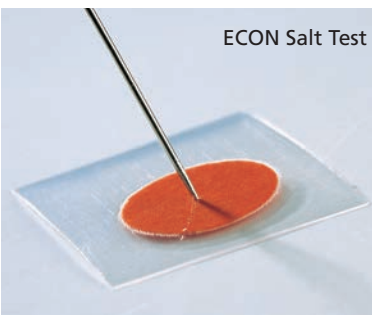
ECON Salt Test

Eliminate rapid corrosion in lube oil, fuel or hydraulic systems by checking for the presence of salt.