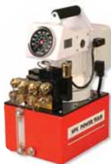
PE55TWP Torque Wrench Applications See page 162

wide range of pre-engineered, off-the-shelf components to build a customized pump to fit specific requirements. By selecting standard components you get a "customized" pump without "customized" prices. All pumps come fully assembled, less oil and ready for work. See pages 102-105.